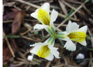
reticulata North Star