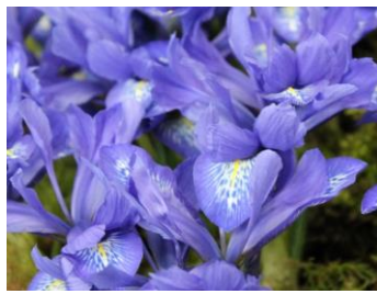
histrioides Lady Beatrix Stanley