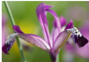
reticulata Spot On