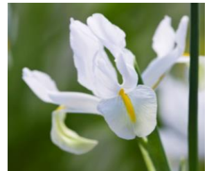
reticulata White Caucasus