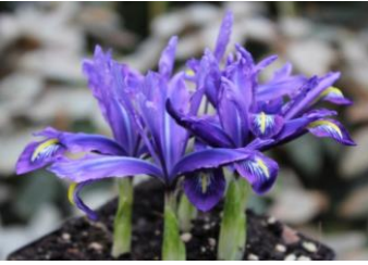
histrioides var sophenensis