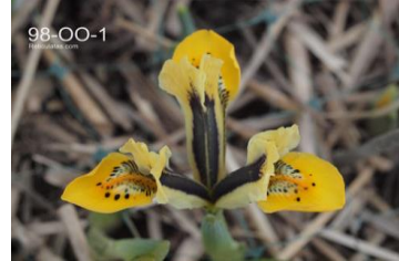
reticulata Orange Glow