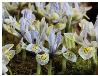
histrioides Katharine Hodgkin