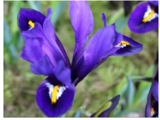
reticulata Blue Hill