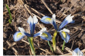
reticulata Sea Breeze