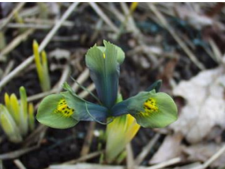
reticulata Sea Green