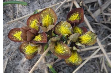
reticulata Mars Landing