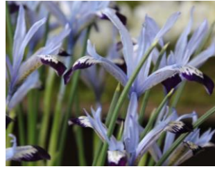
reticulata var bakeriana