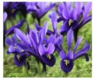
histrioides Palm Spring