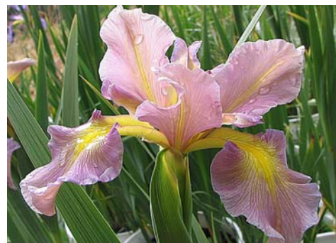
'Some Say It's Pink'

Jenkins by Comanche Acres - 2007