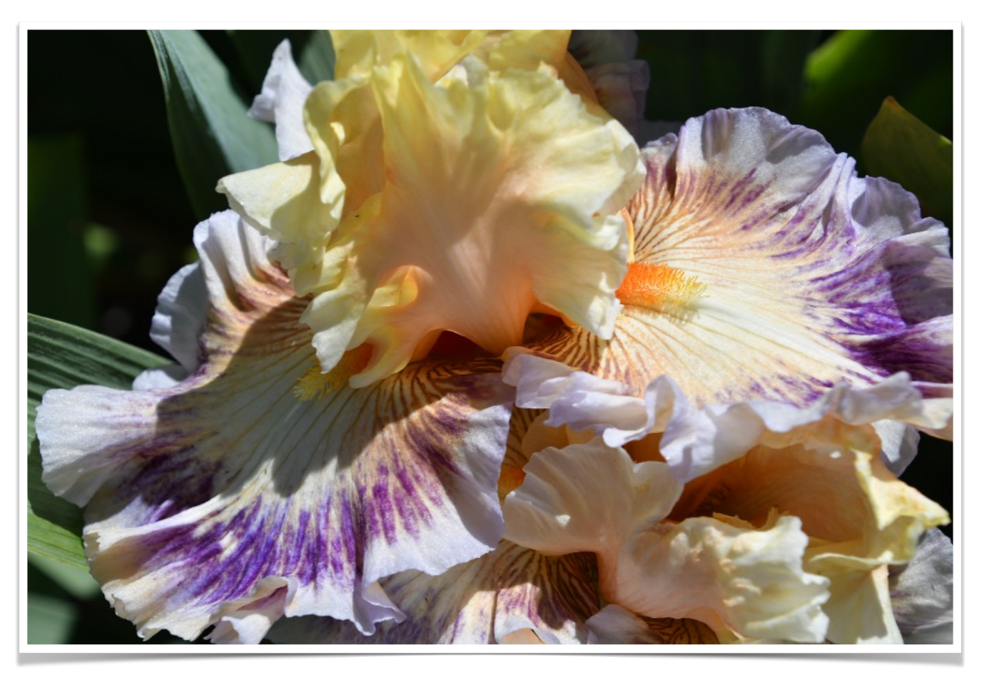
'Arizona Cave Painting' (R. 2020)

The flower's color should be clear with no discoloration. Occasional splotches and patches of untypical color will sometimes occur in the petals due to weather vagaries or virus. Flowers that appear on the specimen stalk must show no signs of aging either from natural processes or the environment. The judge must refrain from accusing an exhibitor of over-refrigeration or forcing, as these accusations are impossible to confirm. One fading flower on a stalk will also cost the exhibitor the loss of a substantial number of points since all flowers should be of similar color intensity.