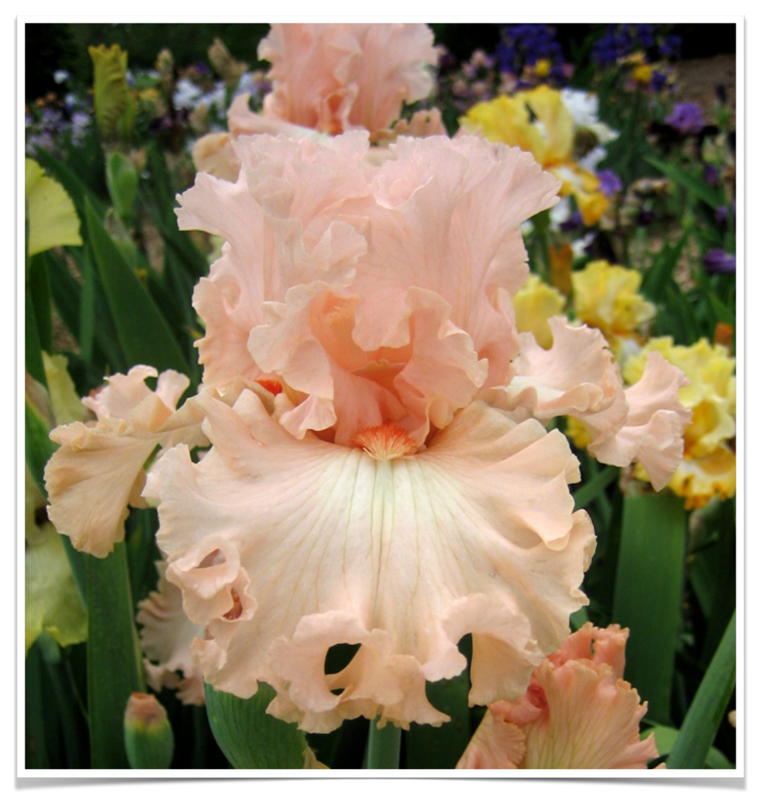
'Kitty Kay' (R. 2002)