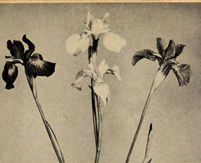
Patriotic Trio of Siberians