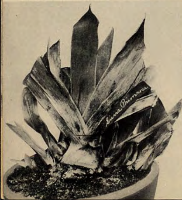
← One of our rhizomes of Sierra Primrose after potting in Germany for Exposition.

German Iris Society. He asked me to extend to American Irisarians a cordial invitation to attend their Exposition at Hannover beginning on April 21, 1951 and continuing to October 31.