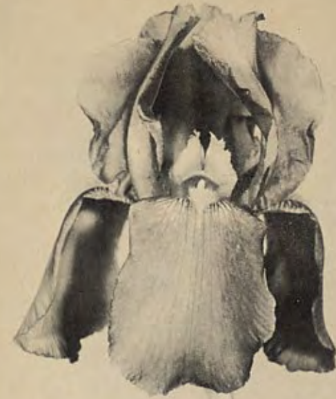
CASA MORENA—Coppery Brown