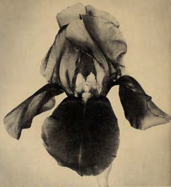
DECEMBER ROYALTY —Richest Purple