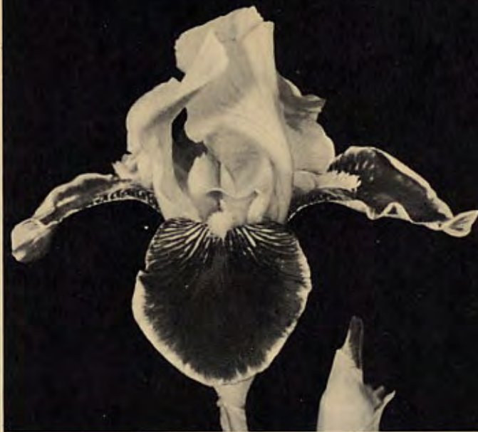
HIGH COMMAND —Yellow and Mahogany