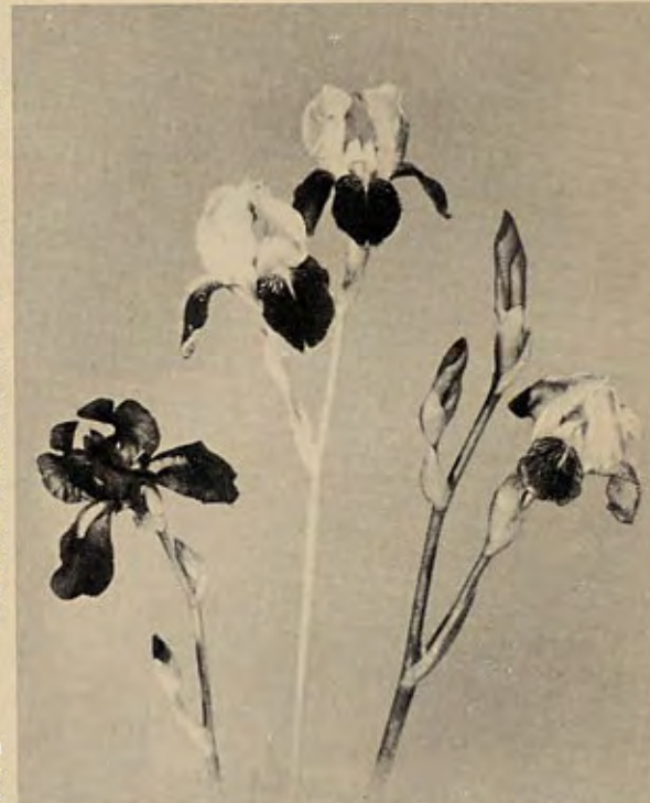
TABLE IRIS—Tom Tit, Lodestar and Zingara.

COMPREHENSIVE LOW-GROWING —The three above collections combined $8.95