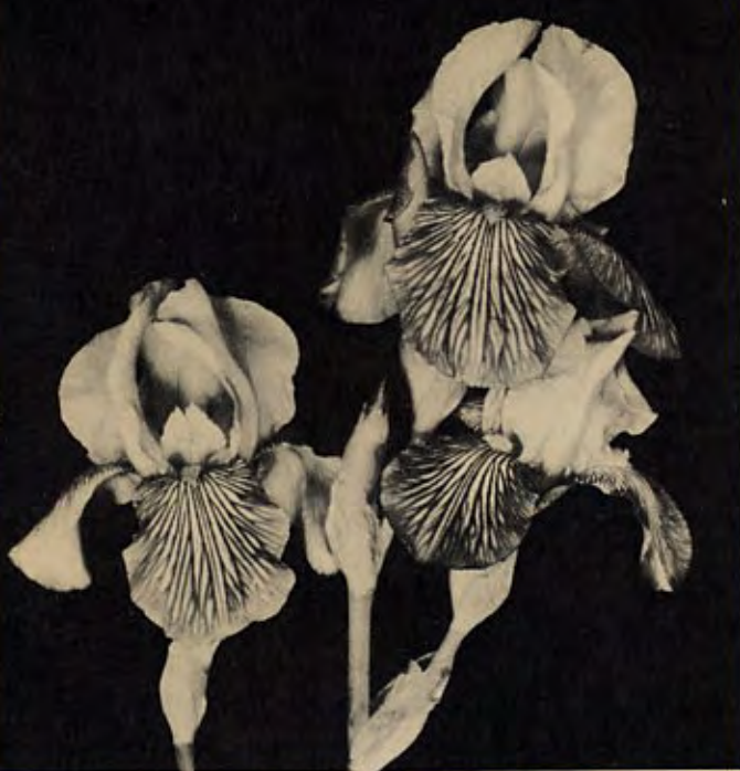
BUTTERFLY WINGS—Colorful Oncobred