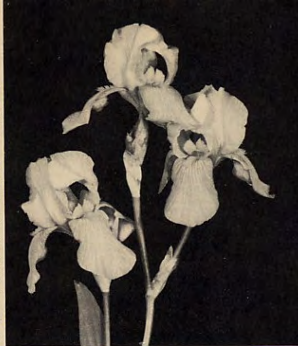
EASTER GOLD—Superb Yellow

The most vivid Iris I offer at such a low price. A brilliant bicolor done in burnt orange and copper-red. EM-34".