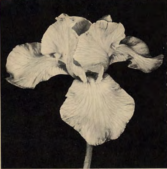
BLUE VALLEY—Blueat of All