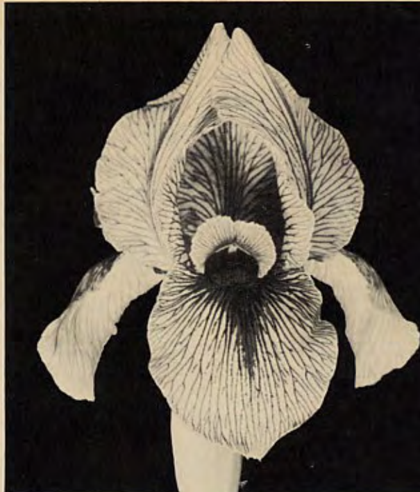
PARTHENOPE — Oncogelia

In Homer's Illiad , Andromache was the devoted wife of Hector. As she appears in the garden, she is a princess clothed in silvery white and violet , with a soft lilac veil. Heavy decorative veining. Signal patch claret-black, very prominent, like an Onco . Style crests wine-red , effectively setting off the flower. Has pollen, sets seed. VE to E-18".