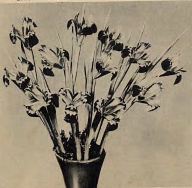
SNAKE'S HEAD IRIS—Black and Green

CUSTOMER'S DELIGHT: "The Snake's Head Iris are in bloom and what a vision. They are just beautiful and I am so thrilled with them that I wish to order 24 for this year. Wore the Iris yesterday at work and created quite a sensation." D.R.D., Menlo Park, Calif.