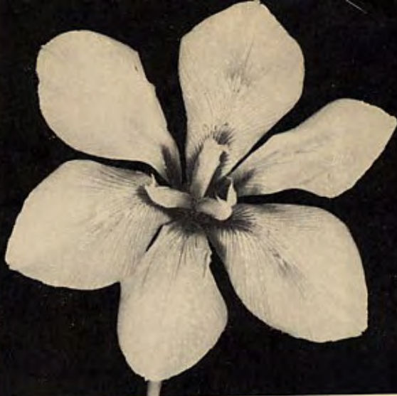
BRIDAL PINK STYLOSA