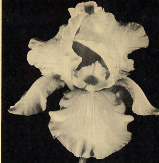
RUFFLED BOUQUET—Rich Cream.

Award of Merit '47. The orange Iris that stands head and shoulders above all competitors. Standards of pure deep chrome, falls smooth vivid orange. Flowers large, done in modern style, with wide petals, exceptionally heavy substance. Introduced at $40; has been rocketing to fame ever since. The English, with their fogs, aren't used to such brilliance, for here's the report that came back when this Rocket reached England: "And now put on sunglasses, for here is an Iris almost too dazzling for the naked eye." A remarkable pollen parent, already having 3 top-notch descendants: Technicolor, Lodestone and Tangier. M-36".