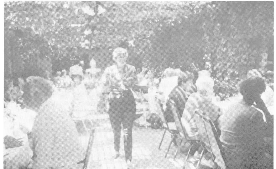
Lunching under the arbor