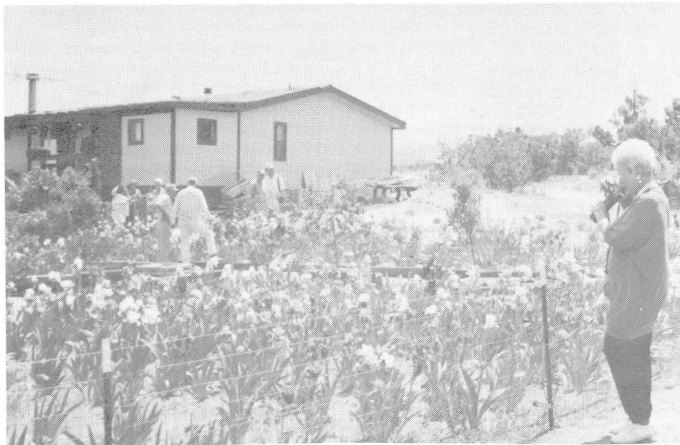
Admiring the contrast between the picturesque arid landscape and luscious iris flowers at Anita Condon's garden.