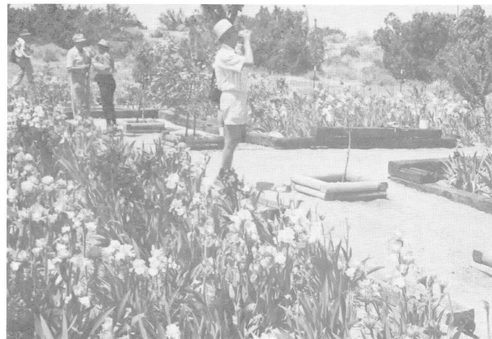
Norm Allen enjoys a cool drink amidst an array of bloom.