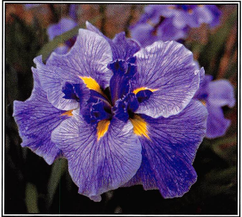
CENTER OF ATTENTION