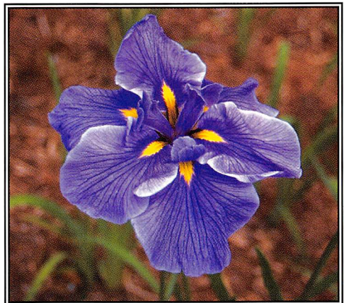
STRUT AND FLOURISH