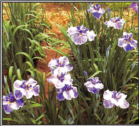
CENTER OF ATTENTION