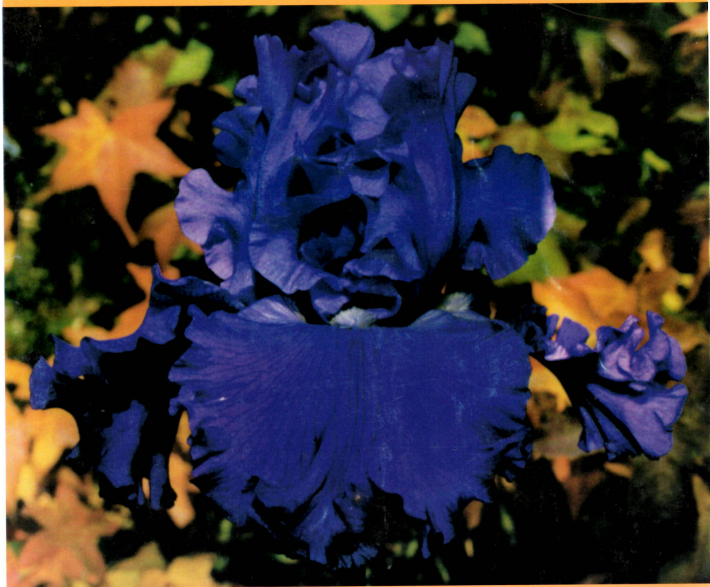
AUTUMN THUNDER Reblooming Tall Bearded Iris G. Sutton '00