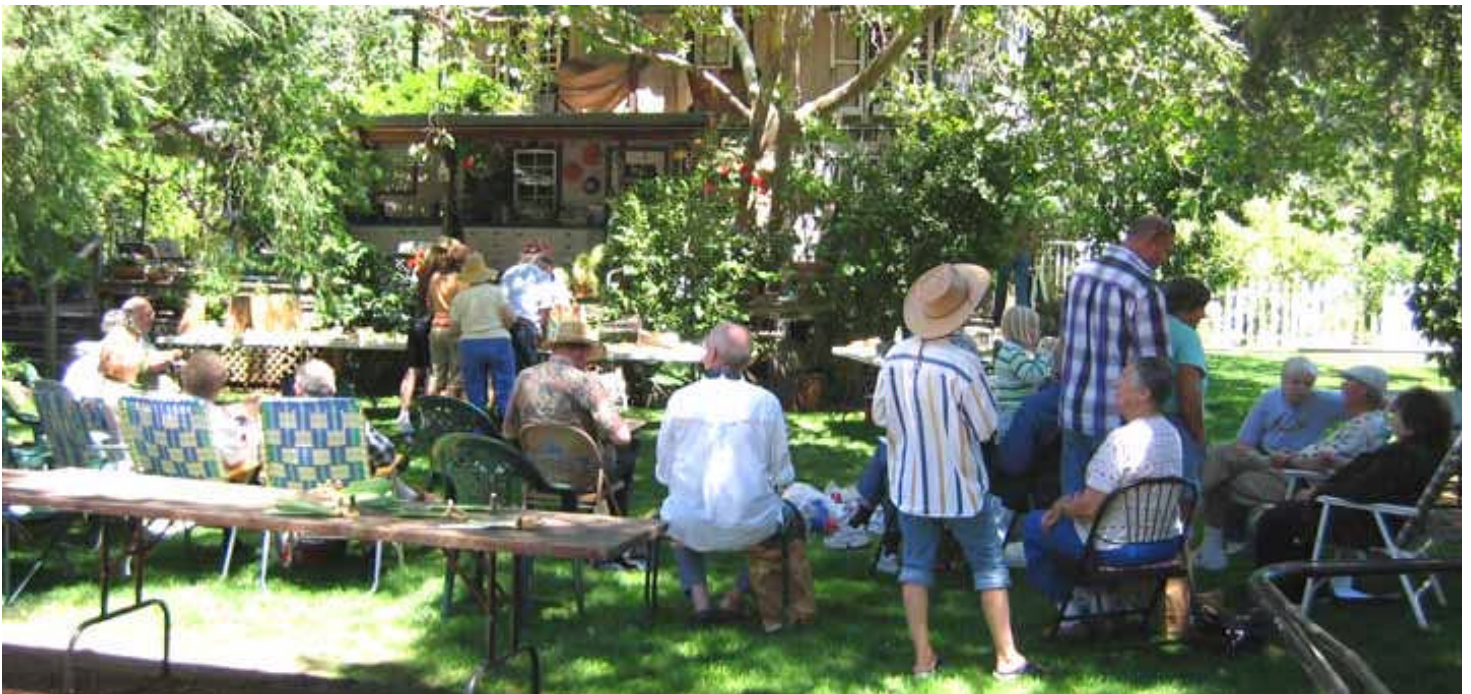
Our great group of intrepid bidders taking a break from the auction.