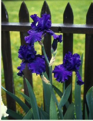
'Dusky Challenger' - 2014 Winner

It's that time of year - another chance to vote for your favorite irises. In this case tall bearded. The 2015 Tall Bearded Iris Symposium is underway. And it is the 75th annual edition!