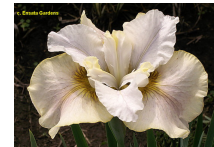
'Book Of Secrets'