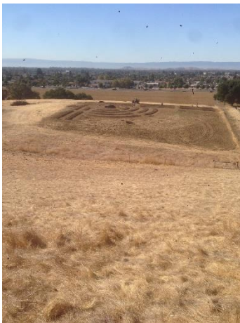
Hill Behind Dry Creek Iris Bed.

What a job, A BIG THANK YOU to all who helped.