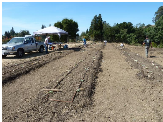
Beginning the Bed