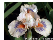
'Web Of Desire'

Several notable items from Dallas and for future Board meetings. A big thank you to the Iris Society of Dallas for hosting the Fall Board Meeting in early November. It was great! Online you can find the motions from the meeting , the reports , and soon the minutes.