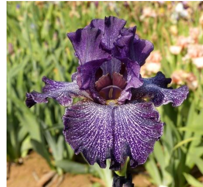
DARK STORM (Tasco 2017) TB, 36", M. Cold white ground peppered dark purple, more solid at edges with black highlights. Show stalks up to 9 buds. Purple based foliage. Lightly ruffled with light sweet fragrance.