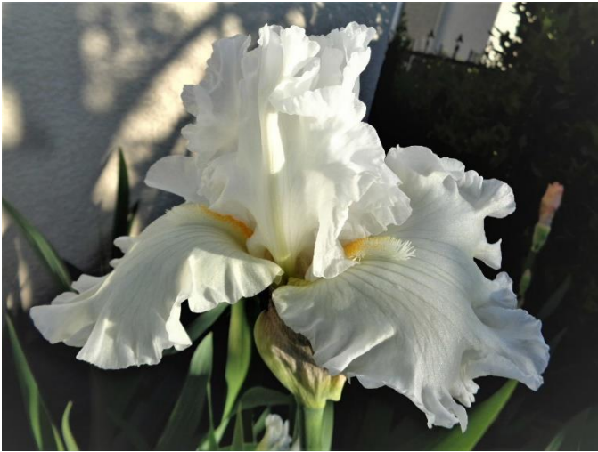
Coconut Snow TB