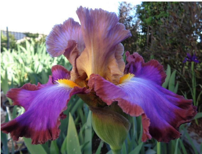
Thrill Ride TB