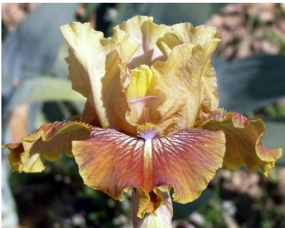
FALL DÉCOR (Sutton 2016) IB, 25", EM & RE. Almond shell colored standards open up slightly to reveal yellow style crests. Interesting burnt umber falls are edged tan and have some white haft markings. September rebloom in our gardens. 5 buds.