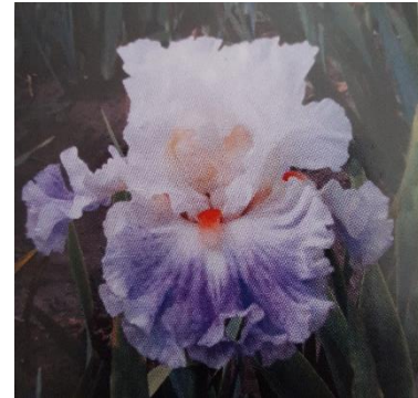
STARMAKER (Ghio 2017) TB, 34", ML. Domed standards are pure white. Falls are white lightly lined and brushed overall lavender-violet. Pink in the heart and white, coral washed styles light up the blooms. Bubble ruffle with tangerine beards. Good bud count and show branching.