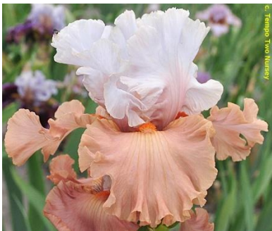
HANDFUL OF MAGIC (Blyth 2016) TB, 38", E. Standards white, slight flush of pink at midribs; Falls uniform medium salmon; beards deep tangerine; slight sweet fragrance.