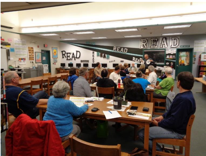
Group Photo from March Meeting.