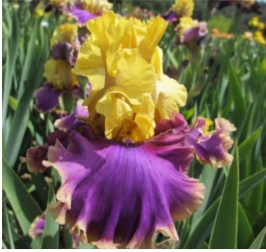
COLOR FLING (Painter 2017) TB, 32", M. Standards yellow; style arms yellow upper, orchid-purple lower; Falls orchid-purple, red shoulders and edge lightening to yellow; beards marigold; slight musky fragrance.