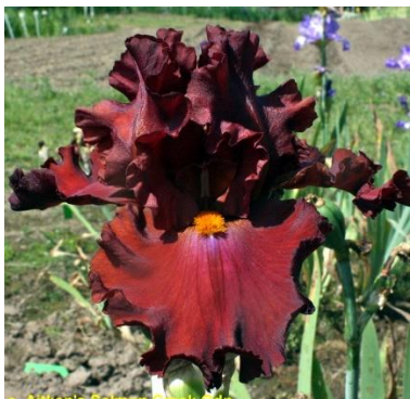
RED TRIUMPH (Aitken 2017) TB, 34", ML. An amalgamation of line bred reds from Ghio and Aitken. This plant has excellent branching and carries 8 buds. Flowers have closed standards and ruffled petals; flared and ruffled falls have no haft marks. Color is a smooth deep red. Bright orange beards are a nice contrast.