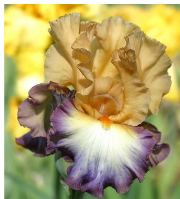
KEY TO MY HEART (Kerr 2014) TB, 36", M. The orange taupe standards are extravagantly ruffled and arched over the tangerine orange beards. The falls are basically white the orange taupe flowing out from the hafts and with an outer band of dark red-violet with a lighter lavender inside halo. Wonderful stalks with plenty of buds.