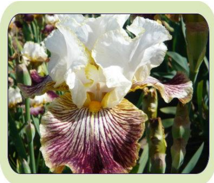
GIVE IT AWAY (Lauer 2016) TB, 33", EM. Standards white with a thin canary yellow rim and at the base of the pedal; Falls white base with canary yellow shoulders and rim, magenta rose lines from the beard to a solid coloring of magenta rose on the rim; Beards tangerine orange; ruffled, pronounced sweet fragrance; On occasion it has had a summer or fall bloom but not consistent.