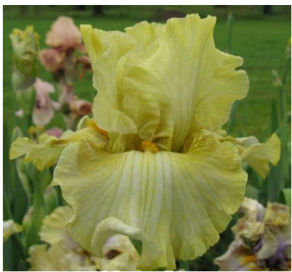
LEMON JADE (J Painter 2015) TB, 38", M. Standards and style arms lemon-green; Falls same, shoulders deeper; beards gold.