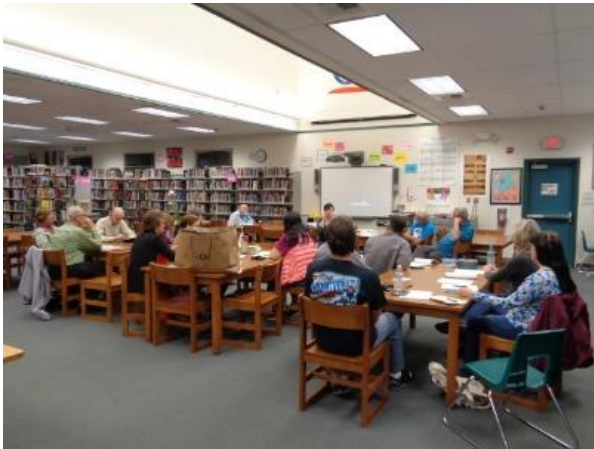
February MDIS Meeting.