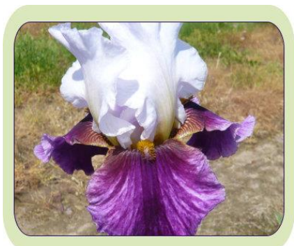
BARBARA JEAN LAUER (Lauer 2017) TB, 32", E-M & RE. Standards white, slight yellow marking on midrib; Falls amethyst violet lightening to plum purple at the end of the pedal, brown shoulders with white lines extending over the falls; Beards tangerine orange; ruffled, pronounced sweet fragrance; two way branching with 7 plus buds. We've had summer and fall blooms each year.