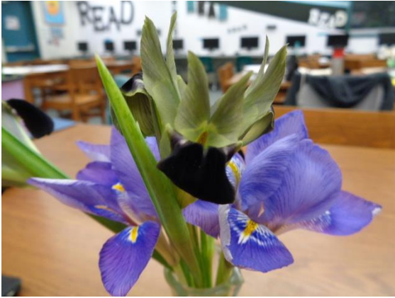
Snake Head & Purple Ungularius.