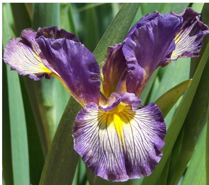
'Banned in Boston' - Vaughn 2012 Jurn photo