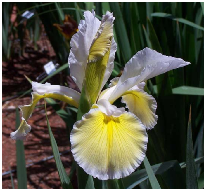
'Under the Rainbow' - Cadd 2008 Jurn photo