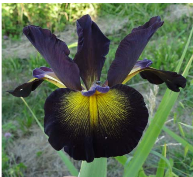
'Black Stetson' - Hedgecock 2018

God Bless you, your families, and your gardens. Jim Hedgecock