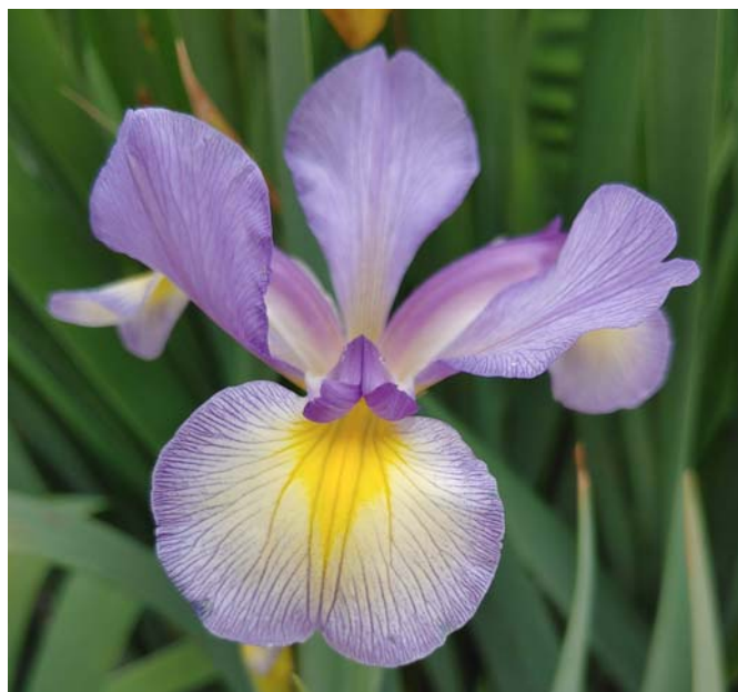
'Cosmic Impact' - Cadd 2006 Cadd photo

This past spring I attempted to cross pollinate several spuria during the 2020 bloom season. For the early bloomers I gathered and stored (in the refrigerator) the pollen of individual blooms until such time a suitable recipient bloom presented it's time for penalization. For about half of the crosses I used fresh pollen. I attempted 11 crosses. As the weeks passed it became apparent that my hybridizing skills are less than adequate as NONE of my 11 attempted crosses took. During the same period nature successfully made at least the same number of crosses. So I will seek the assistance from a known successful hybridizer before the 2021 bloom season arrives.