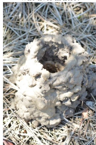
Who lives in here?