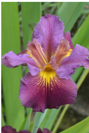
Bad Moon Rising 2017 (LA) by O'Connor