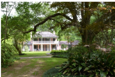
Excursion to Windrush Plantation