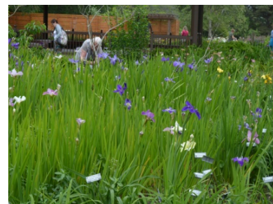
The Louisiana iris grow like weeds!