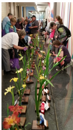
Visiting the SLI Show for photos and lots of "Ohhhhh" and "Ahhhh!"