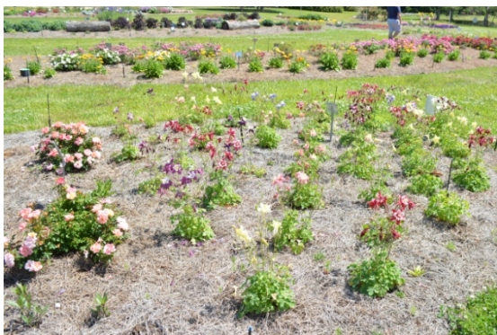
At the Hammond Research Station we saw a rain garden, a place to capture and store rain.