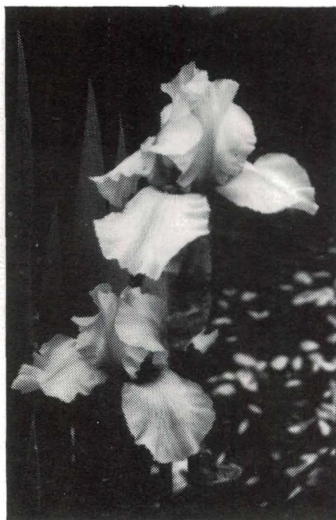
AM I BLUE