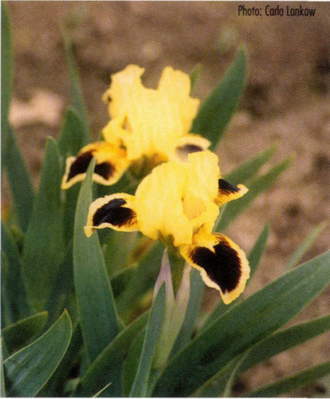
BUGSY (B.Hager), Coparne-Welch Medal