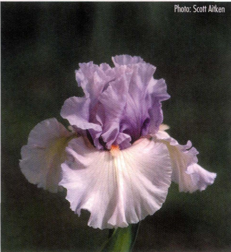
FOGBOUND (K.Keppel), Walther Cup runner up