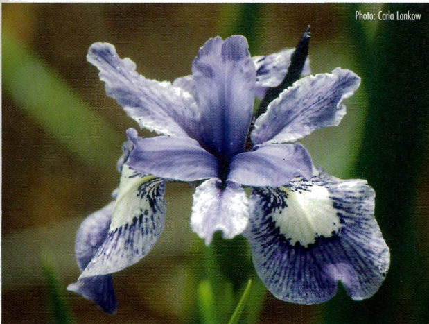
DOTTED LINE (L. Reid) SPECIES Winner of FOUNDERS of SIGMA Medal