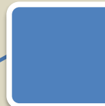
Seedling# H159-2, ' Final Episode ' sibling