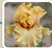
seedling L185-A, ' Mango Daiquiri ' sibling.