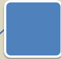
Seedling M65-2, ' Let's Rompe ' sibling