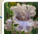
' Stop Flirting '.