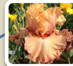
' Temple Of Time '