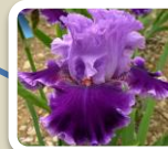
' Louisa's Song ',